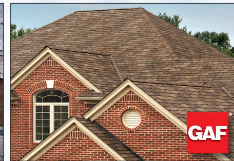
GAF Shingles with Class F and Class H wind ratings are the best choice for protecting your home.