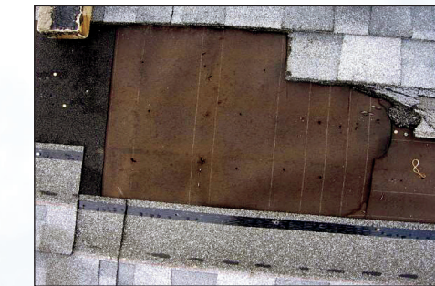
Blown-off shingles may expose your home to structural damage, mold, and mildew.

**GAF-warranted wind speeds may be less than those listed above. See GAF Shingle & Accessory Ltd. Warranty for complete coverage and restrictions.